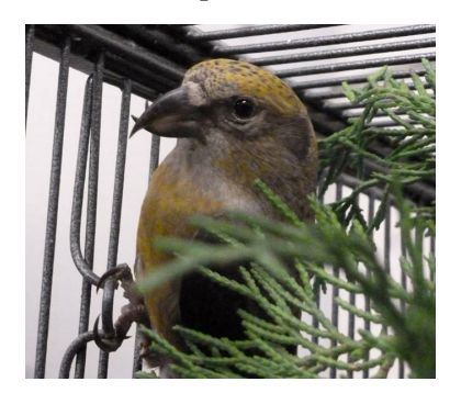
This Crossbill was found unable to fly in Abbots Wood due to concussion

If you are unable to approach the bird then monitor it carefully for any signs of illness or injury and call for advice if a bird is grounded for an extended period of time.